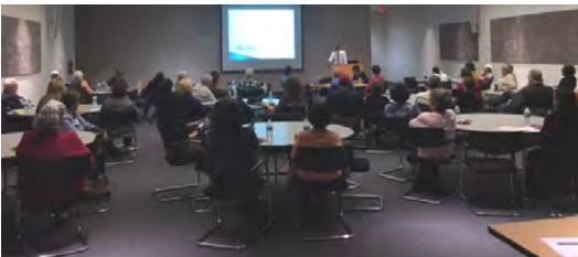
Retirees listen to a presentation from Aetna during the March Brown Bag session.

To reserve your seat, leave a message on the Retiree RSVP Line at 210-207-7000 or email hrcustomerservice@sanantonio.gov .