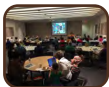
Retirees attend August Brown Bag Session at the Central Library

To reserve your seat, leave a message on the Retiree RSVP Line at 210-207-7000 or email hrcustomerservice@sanantonio.gov .